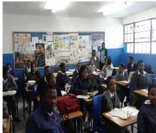
Grade 12, Class 2016 Qhayiya High School