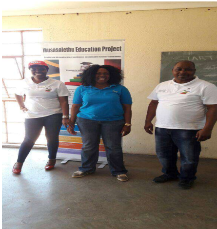
Team and the Principal

After that the Principal thanked the team and requested for a long partnership with her school, which was agreed on and will be one of the schools that Ikusasaletu Education Project will have long relations with.