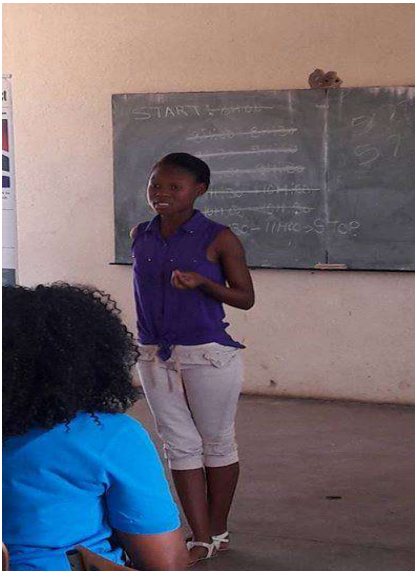
Grade 12 learner thanking the team