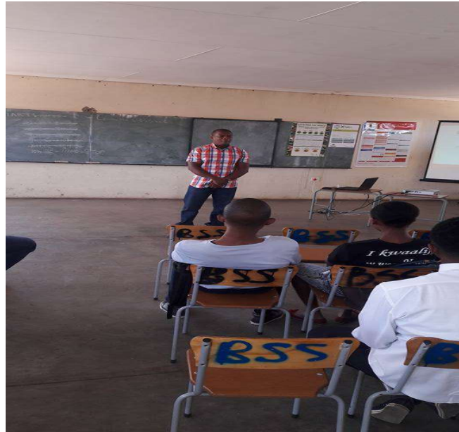
Masters and PhD students from University of Pretoria