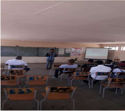
Wits student addressing learners